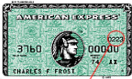
Card ID #