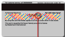
Card ID #

3-digit, non-embossed number printed on the signature panel on the back of the card immediately following the Visa card account number. This number is recorded as an additional security precaution.